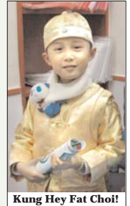
Kung Hey Fat Choi!

Don't worry if you found some of the questions difficult or didn't know where some of the countries are. The next RTL newsletter will include a helpful section on Geography!